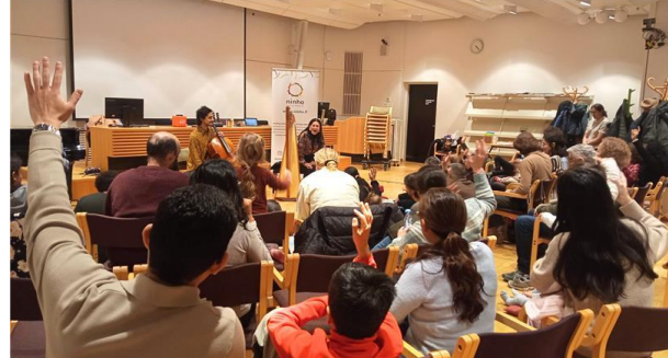
Closing session of PICNIC 2025 Autumn season

By the initiative of the PICNIC families, they are in the process of creating a NEW PICNIC encounter, in Espoo in Sello Library. Picnic sessions welcomed more than 470 attendees in 2025. Plans for the Spring of 2026 are already in place.