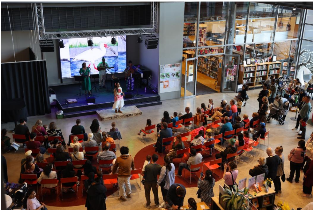
Jaranas del Norte at Sello Library, Kolibrí Festivaali 2025.