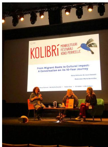
Volunteers Training Lastenkulttuurifoorumi panel