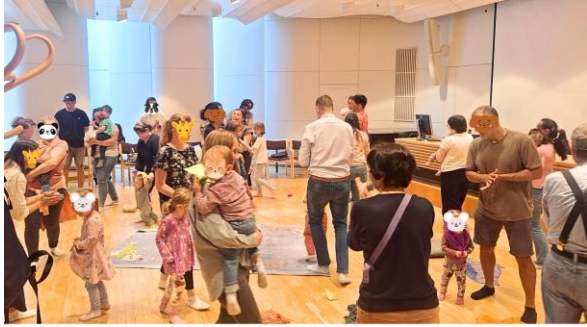
Opening of PICNIC 2025 Autumn season