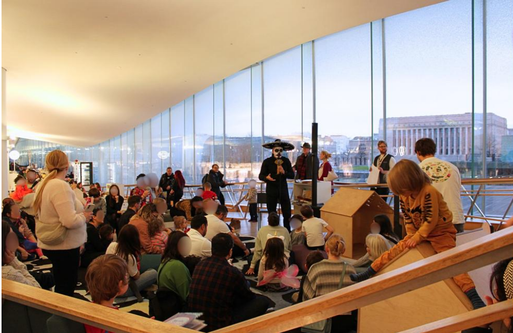
Storytelling session in Spanish.